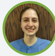
NORMA Youth Apprentice (LTE)

I've volunteered as a dental hygienist at free clinics throughout my career. I've also worked on the Ronald McDonald dental mobile as a fill-in dental assistant. I feel very fortunate for the opportunity to use my dental hygiene skills and knowledge to give back to the community I live in. Being part of preventative health care is something I am enthusiastic about.